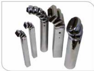
• Special Mandrels for Profiles • Spezielle Dornen für Profile • Специальные дорны для профилей