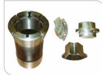
• Collars • Spreitzdornen • Двухконный дорн