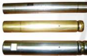
• Standard Mandrel • Standard Dorn • Стандартный дорн • Amiko Mandrel with 1 Ball • Amiko Dorn mit 1 Ball • АМКО дорн с 1 шариком • 4 Ball Mandrel • 4 Ball Dorn • Дорн с 4 шариками