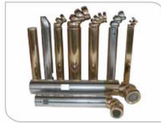
• Mandrels • Dornen • Дорны