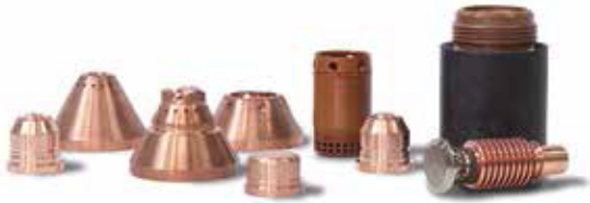
Duramax Hyamp 180° full-length machine torch replacement parts